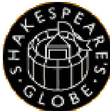
A non fencing graphic !!!!

We also do a few spur of the moment events—like croquet if it's nice.